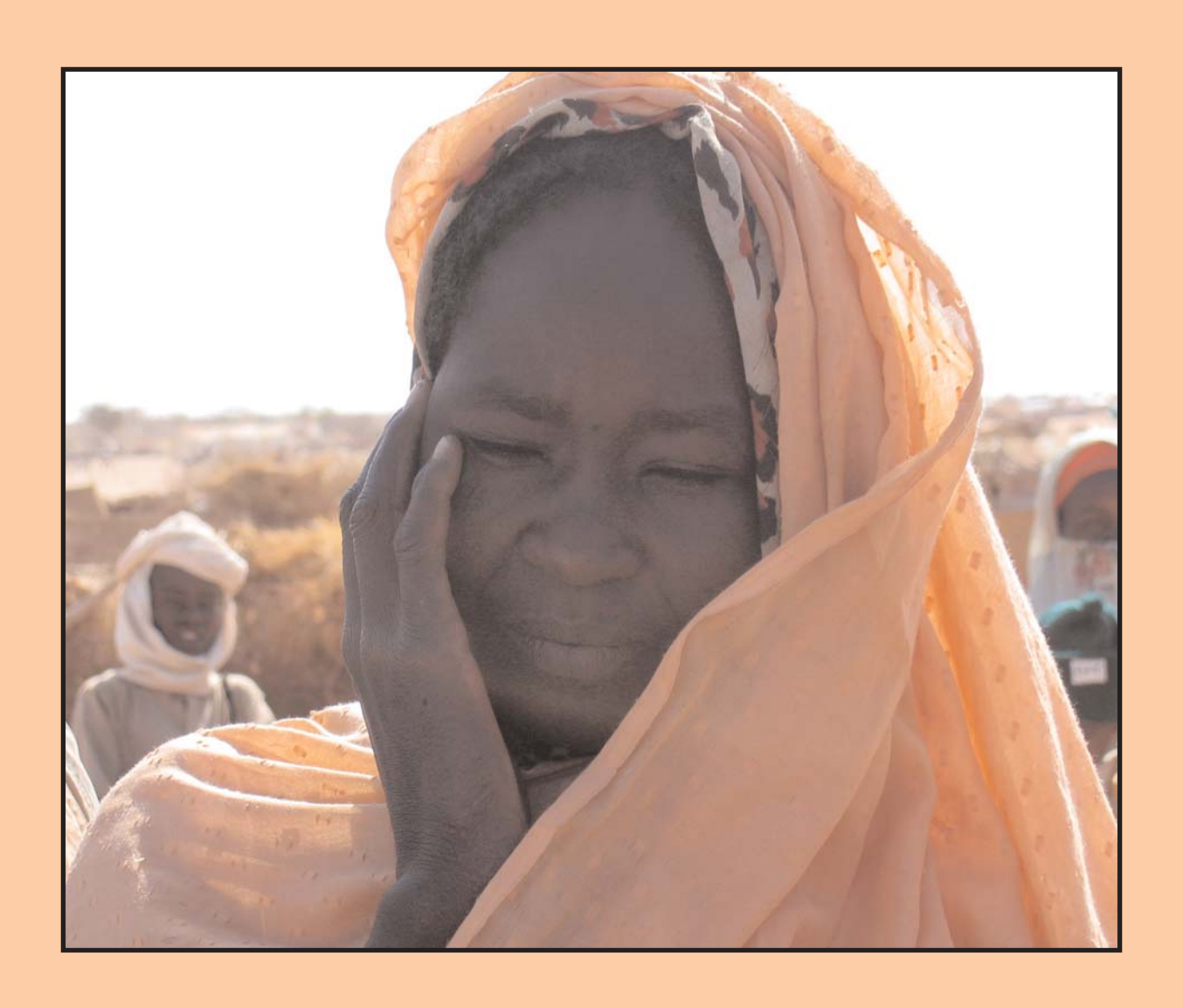
Women's Commission for Refugee Women and Children

Risk Factors, Protection Solutions and Resource Tools