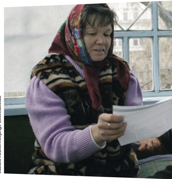
Vaxim Ahner/HelpAge International

Similar arguments could have been made about children, women and disabled people's rights. However, there is now near universal acceptance of the need for international law to protect these groups. The conventions protecting children and women have changed attitudes and resulted in reform of domestic legislation, and financial resources have been allocated for their implementation. Lessons can be learnt from the experience of existing reporting mechanisms to make the reporting process simpler. Arguments against a convention should not be dismissed, but they are not strong enough reasons for continuing to discriminate against older people in international law as well as in practice.