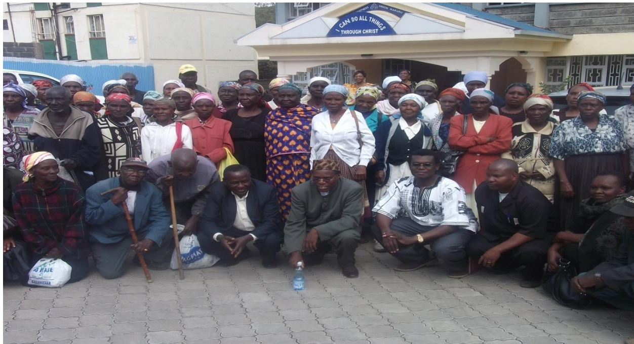
Participants together with the guest of honor and the Director CARD Kenya posing for a photo after a successful day

It was the delight of the organization to have achieved more than was expected even with the lean budget and any future support from various stakeholders will be gladly welcomed to ensure a society that appreciates, empowers and embraces older persons as part and parcel of the society.