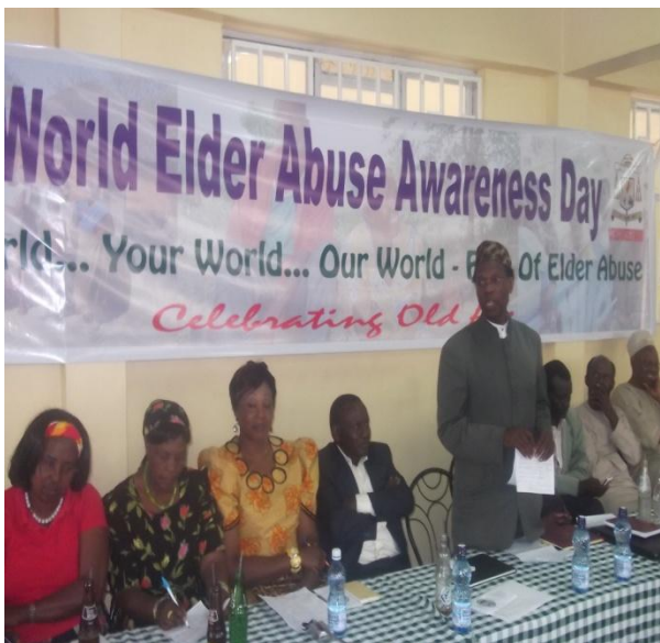
The guest of honor, Hon.Koigi Wamwere giving his speech

More efforts needed to be put in place to ensure economic and social independence of the elderly in the society and to ensure that they adequately participate in all areas of development in order to give them the opportunity to make informed and independent decisions. These sentiments were further reinforced by the guest of honor who added that the older persons in IDP camps were worse off and were virtually a forgotten lot yet they required special attention to address their needs and went ahead to acknowledge the efforts that CARD were putting in place to ensure that all older persons irrespective of race or religious background were attended to.