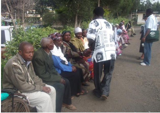
The Director welcoming participants who had already arrived