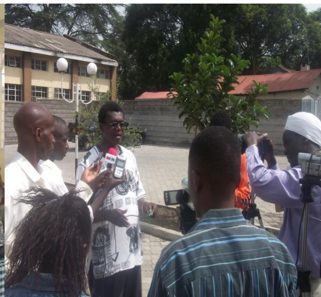
The Director CARD Kenya addressing the press

JSC Bldg, 2nd Flr, off Nakuru-Nairobi Highway; Behind Triton Petrol Station P.O.BOX 18246 Nakuru 20100; Tel No. 020 238 2354; Cell No. 0733 556 859, 0722 556 859 Email:info@cardkenya.org www.cardkenya.org