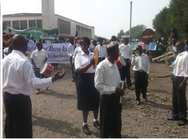
Beginning of the procession led by the band

The procession then went on as had been planned through Kenyatta Avenue, Moi Avenue and then ended at St. Paul's University grounds where all the guests converged for a series of photo sessions before going ahead to settle in the hall where the event was to take place.