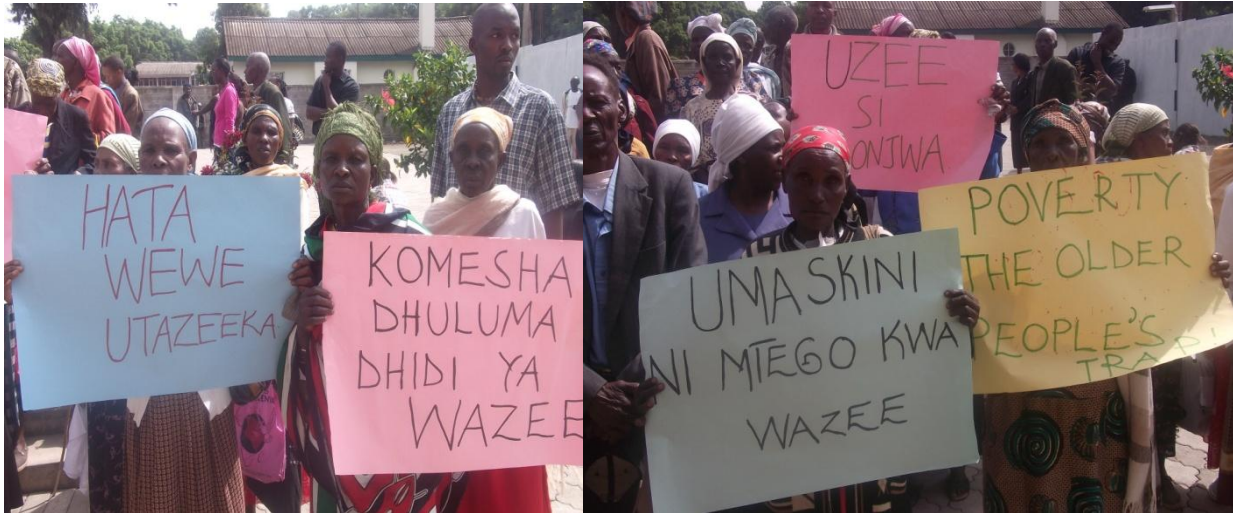
Older persons letting their sentiments known to the whole world

Majority of the guests who spoke stressed the need to strengthen local government mechanisms to provide for financial support through pensions and cash transfers to older persons. The government was widely blamed for the plight that majority of the older persons are currently going through and were challenged to put mechanisms to reduce the age limit for beneficiaries of the cash transfer fund from 80 years to at least 60 years which is a recommended age bracket according to the UN guidelines.