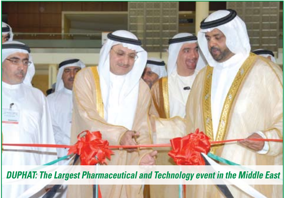
DUPHAT: The Largest Pharmaceutical and Technology event in the Middle East