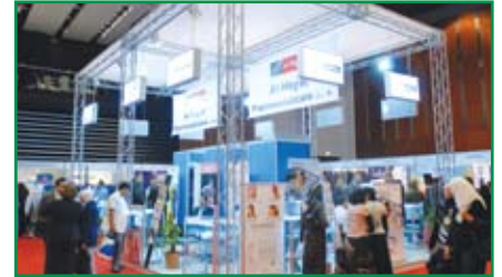
INCREASE IN DUPHAT EXHIBITION SIZE

Oncologic Therapy Planning, Therapy Monitoring and the Preparation of Cytotoxics, Developers of Health Care Multi-media, UAE Free Zones which serves as a home to Pharma firms, Biolab Equipment and Fluid Solutions and Pharma Financiers.