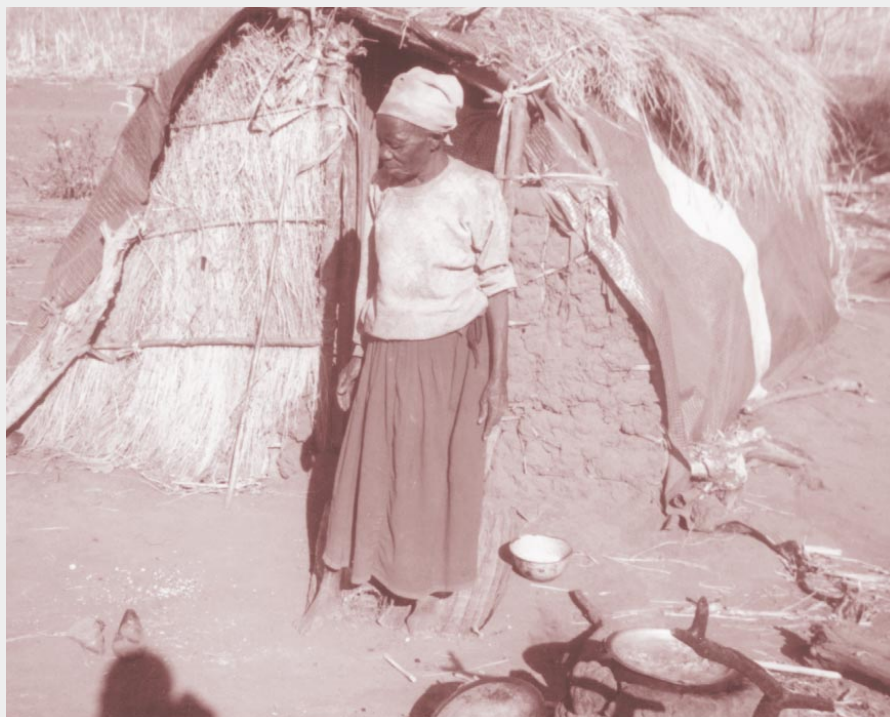
Older people are the poorest of the poor

The consultations with older people held in May 2004 revealed that older people lack income, which makes it difficult to buy basic necessities or get access to social services. Lack of access to food was identified as the biggest difficulty for those older people who do not have children to rely upon. In