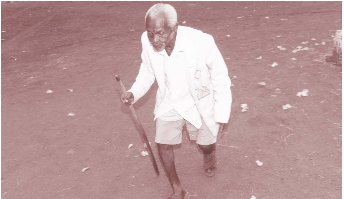
Respecting older people's rights, ensures that they enjoy their old age

Older people in Cameroon face a multiplicity of abuse of their rights. They are often imprisoned for flimsy and sometimes trumped up charges. This trend of events motivated the HelpAge affiliate - the Regional Centre for the Welfare of Ageing Persons in Cameroon (RECEWAPEC) - to create a Legal Department exclusively for the defense of older persons. Services are offered to older persons at no charge.