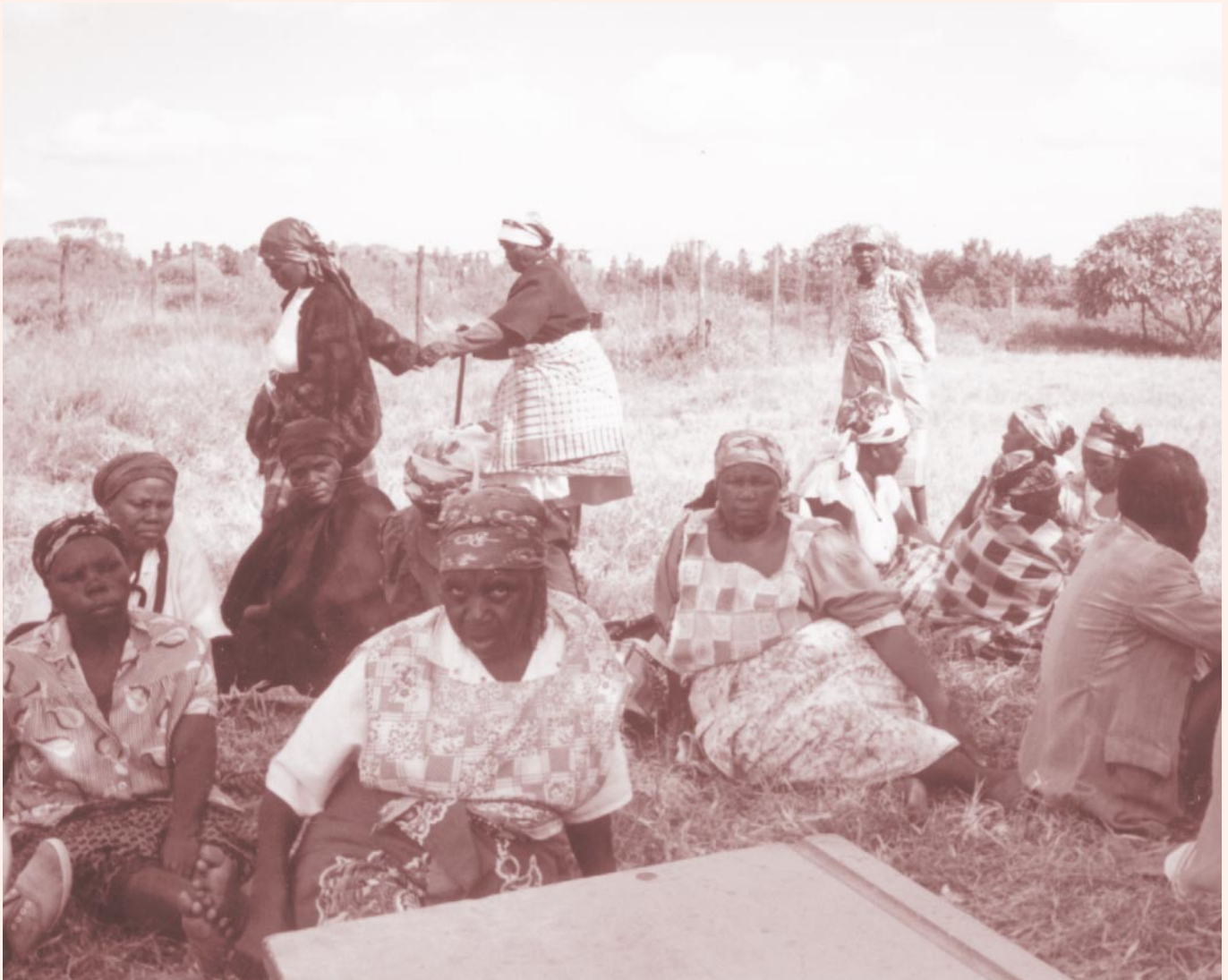
Umtfunti aims at a better life for older people

U mtfunti weMaswati was founded in 1966 and registered on 2nd February 1988 to raise awareness in the community of the needs of older people. Initially the Association was called The Swazi Retired Centre before being renamed Umtfunti Old Age Association.