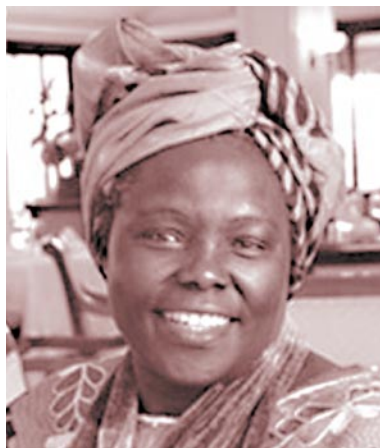
Laureate Prof. Wangari Maathai

Older people continue to prove that advanced age is not a hindrance to achievement.